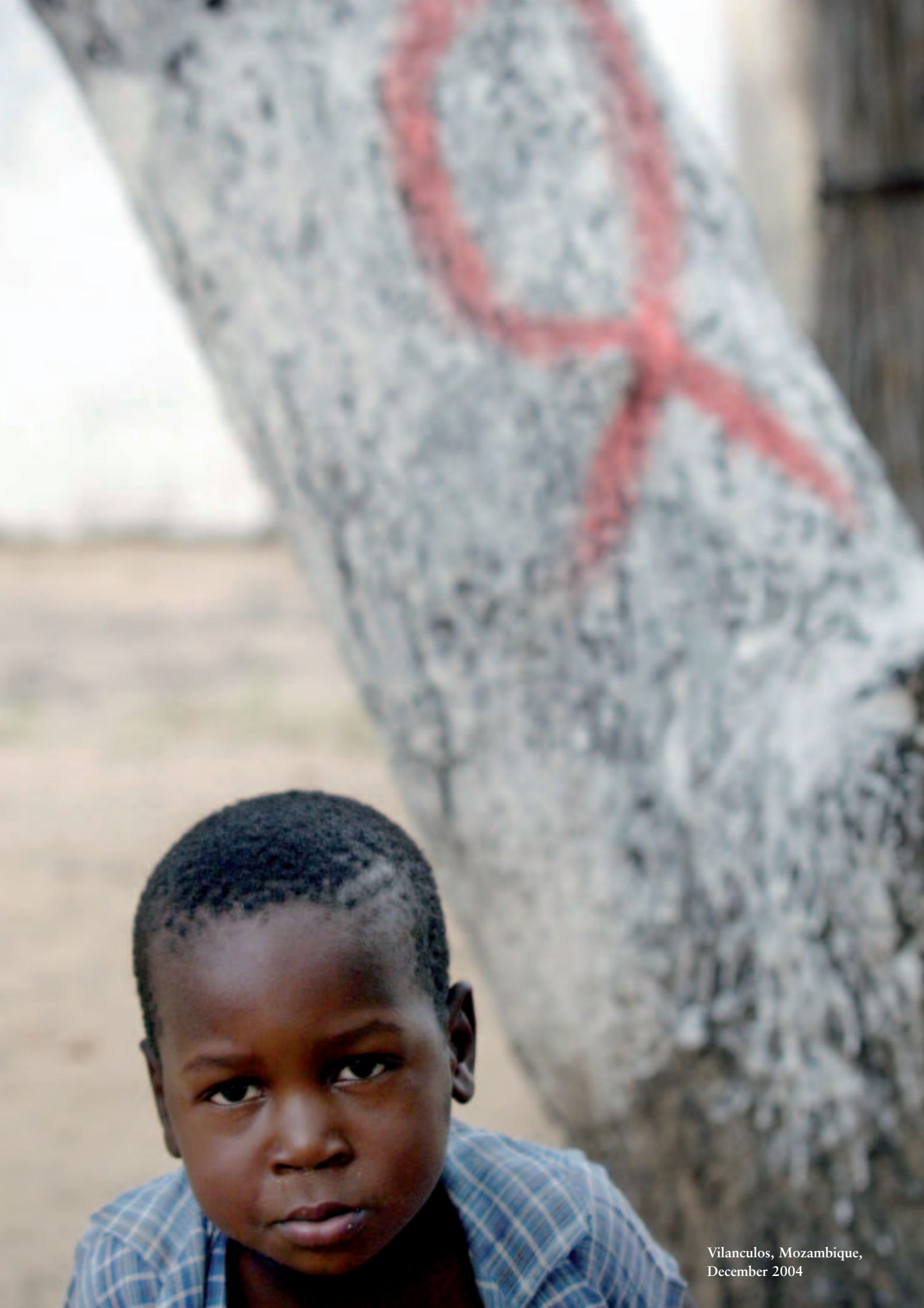
Vilanculos, Mozambique, December 2004