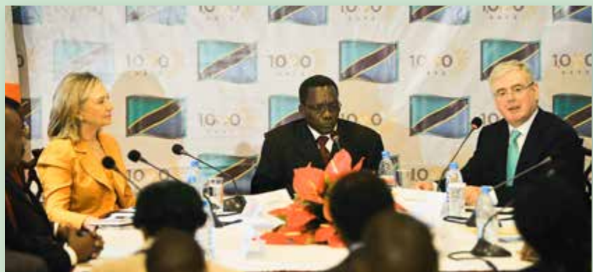
An Tánaiste and Minister for Foreign Affairs Eamon Gilmore with US Secretary of State, Hillary Rodham Clinton and Prime Minister Pinda of Tanzania at the launch of the 1000 Days Initiative in Dar es Salaam, June 2011.

Nutrition and Health, coordinates the HarvestPlus Challenge Program, which works on biofortified staple foods for the poor, and conducts evidence-based research on issues such as integrated approaches to address undernutrition, value chains for improved nutrition, and evaluations of food security interventions.